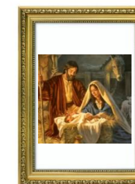
Baby Jesus, Mary and Joseph